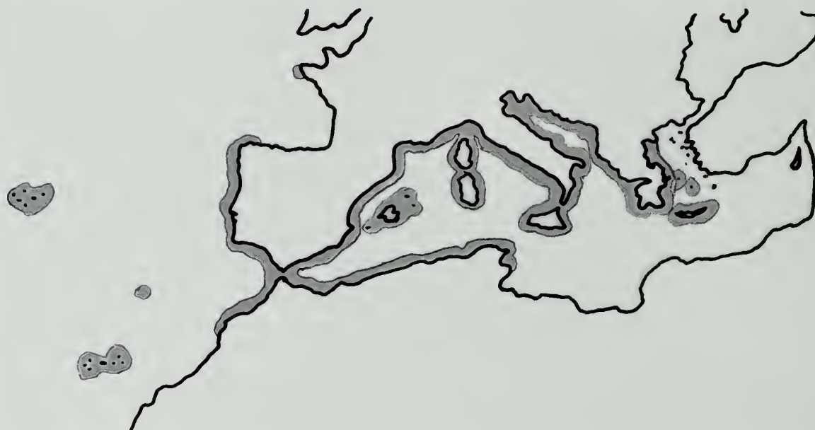
Figure 14. Distribution area of Calliostoma conulum .